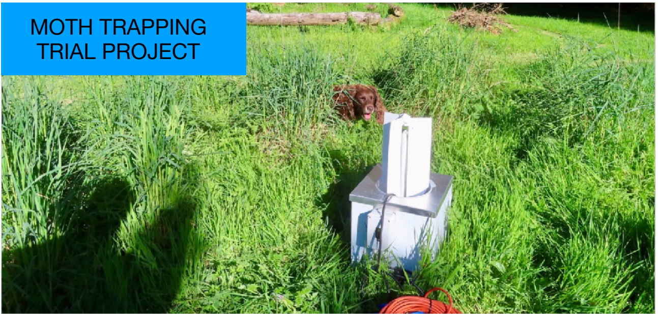
MOTH TRAPPING TRIAL PROJECT