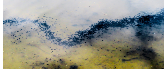
A 'swarm' of toad tadpoles.