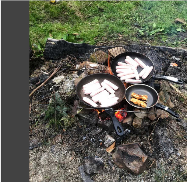
Sausages and woodsmoke with Biggar Cubs.